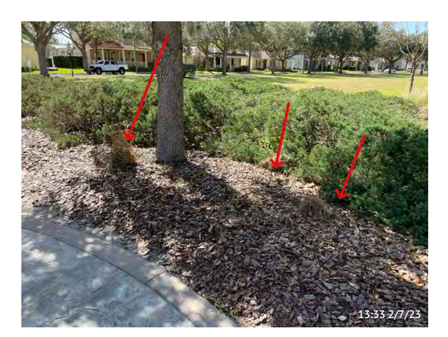
Item 49 - Buck Lake Pavillion Assigned To Benchmark Plants needs attention.