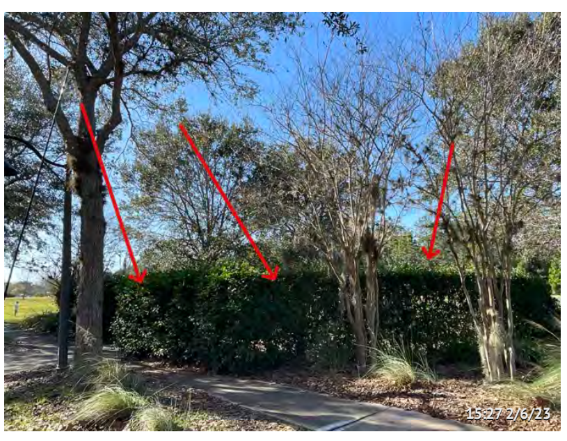
Item 30 - Oak Glenn Trail