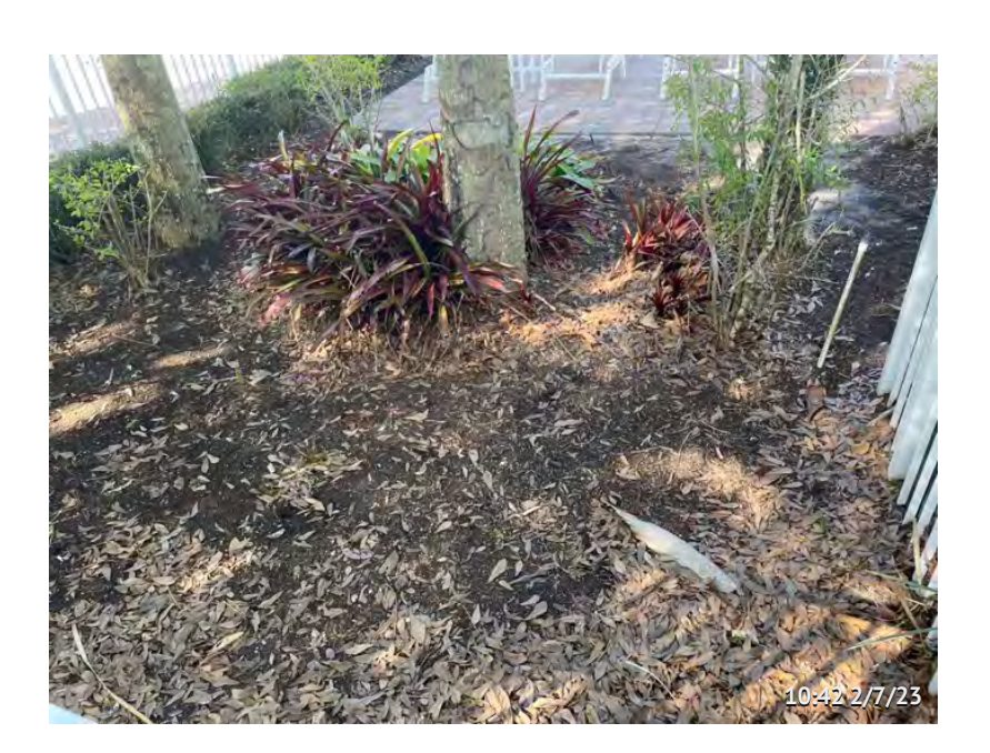
Item 39 - Swim Club Assigned To Benchmark Garden needs attention and mulch installation.