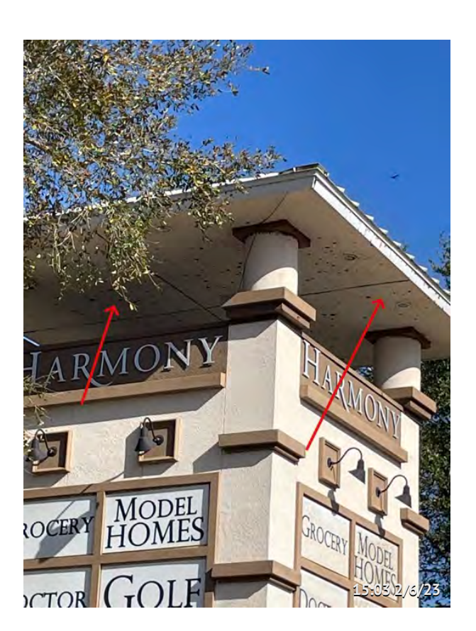
Item 23 - East Entrance Median Tower