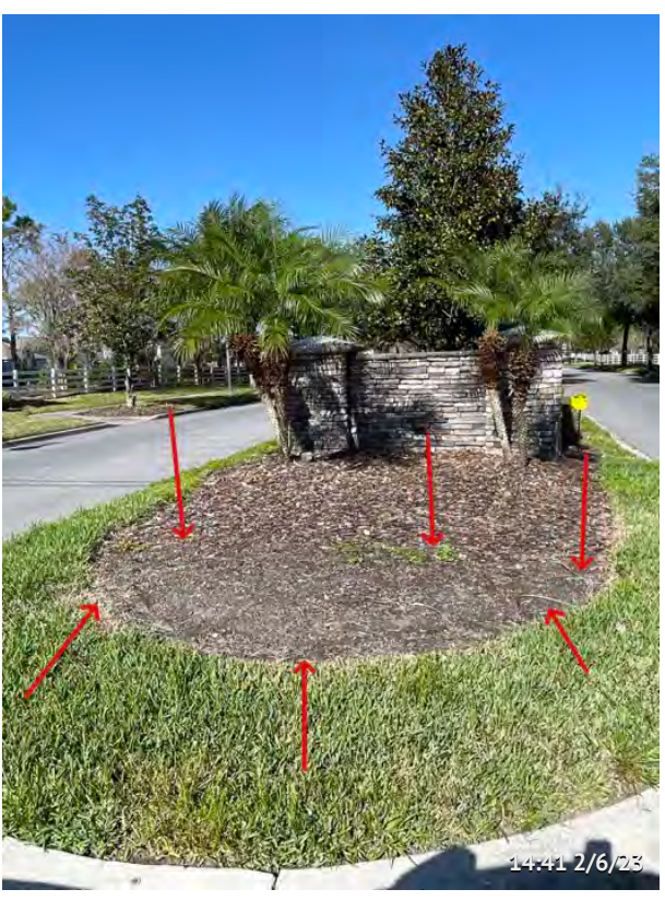
Item 14 - West Entrance Median Assigned To Benchmark Seasonal Plants proposal.

Behind the Harmony CDD sign in the right side, needs attention, tall grass growing.