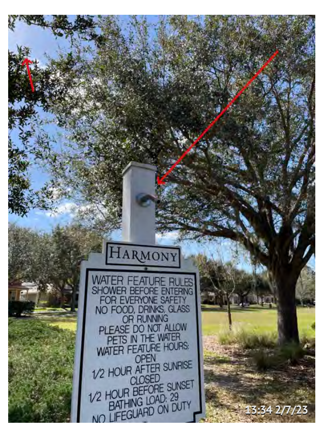
Item 50 - Splashpad Assigned To Inframark A new shower head needed.