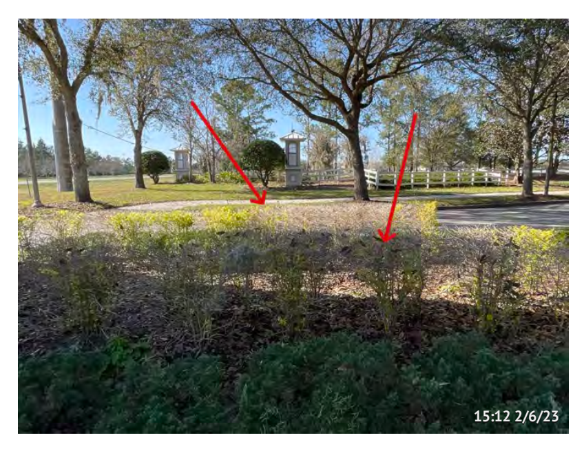
Item 26 - East Entrance median Assigned To Benchmark Dried plants.

Behind the fence needs attention, tall grass.