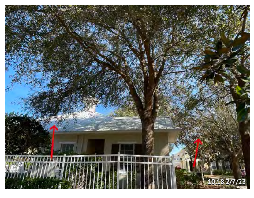
Item 34 - Ashley Pool Assigned To Benchmark