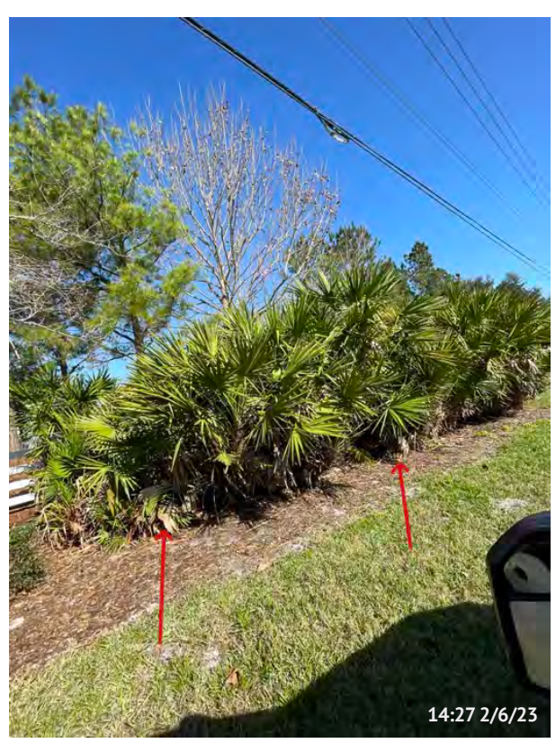
Item 10 - Front and Behind Fence US-192 (West Side)