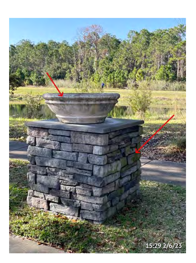
Item 31 - Oak Glen Trail Tower Assigned To Inframark Tower needs Pressure washing.