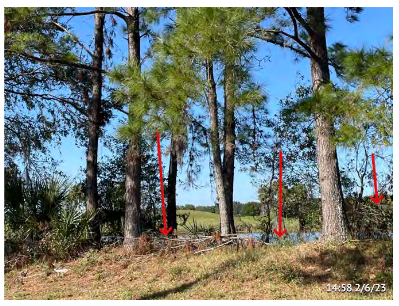
Item 22 - Clay Brick Rd.