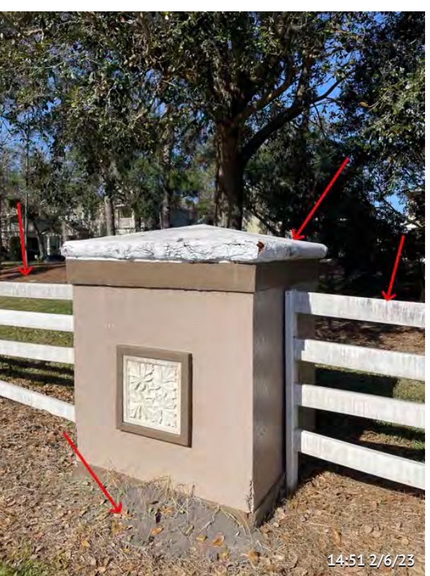
Item 18 - Fence Tower Assigned To Benchmarks - Inframark Needs paint, repair in the top andth e fence needs pressure washing.Ant Mounds need attention.