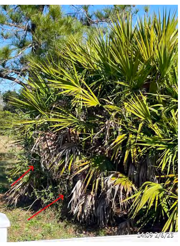
Item 2 - Behind Fence US-192( West Side)

A removal and replacement Proposal needed.