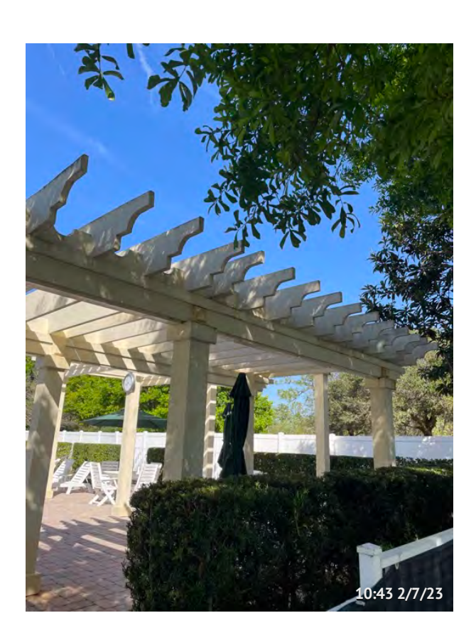
Item 41 - Swim Club Assigned To Inframark Pergola needs paint.