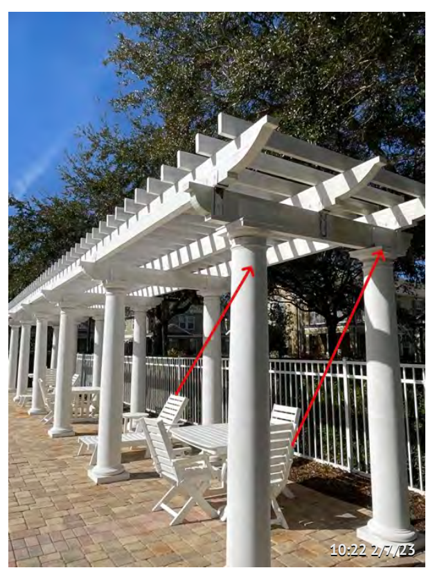
Item 36 - Ashley Pool Assigned To Inframark Pergola needs to be painted.