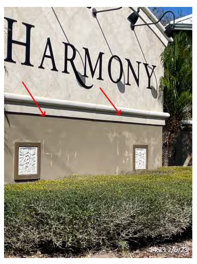
Item 8 - Harmony Sign West Entrance