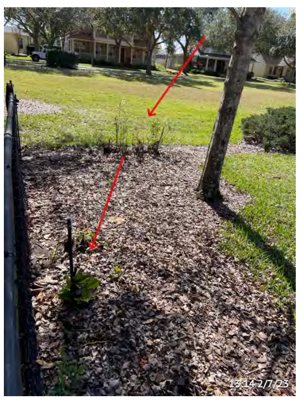
Item 48 - Buck Lake Pavillion Assigned To Benchmark Garden needs attention.