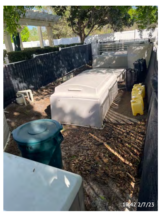
Item 40 - Swim Club (Pool Equipment) Assigned To Inframark Ornamental rocks proposal needed.