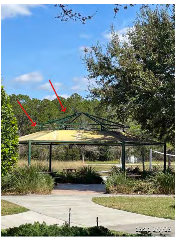
Item 46 - Buck Lake Pavillion