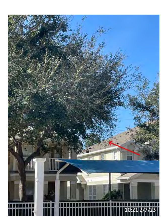
Item 35 - Ashley Pool Assigned To Benchmark Tree branch trimming proposal needed.