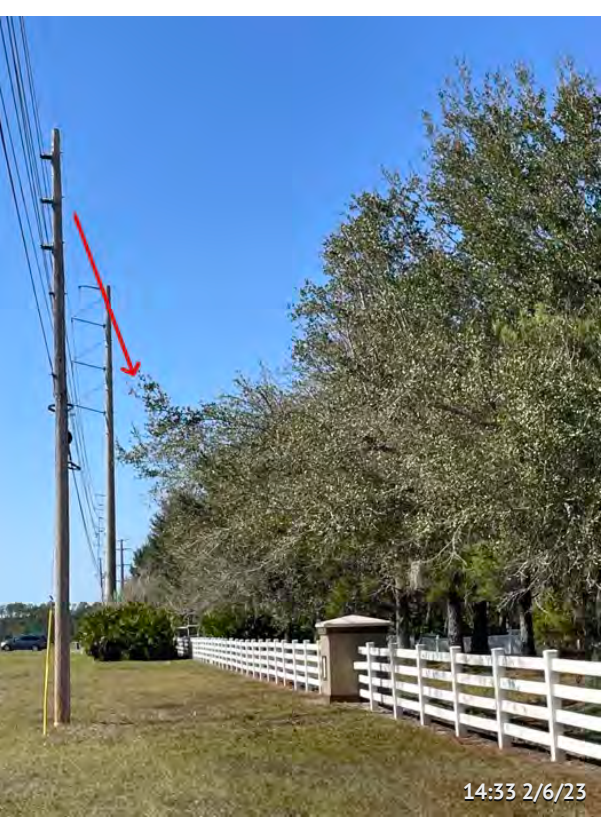
Item 12 - Front Fence US-192 (West Side)

The Palmettos that are touching the fence, needs to be trimmed up and the tree branches as well.