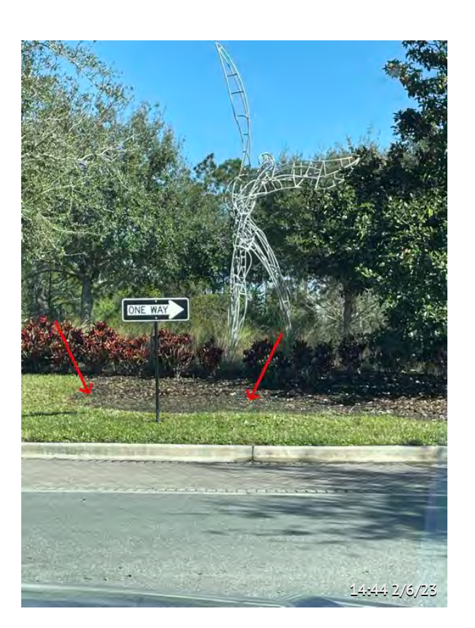
Item 15 - Five Oaks - Schoolhouse Rd Round

Assigned To Benchmark Seasonal Plants Proposal.