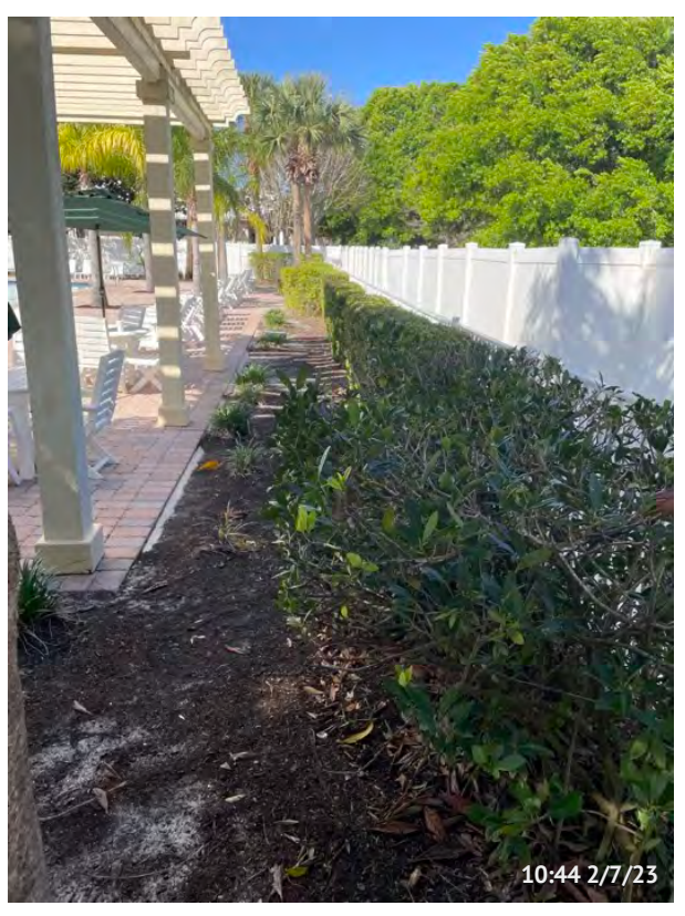
Item 42 - Swim Club Assigned To Benchmark Mulch proposal needed.