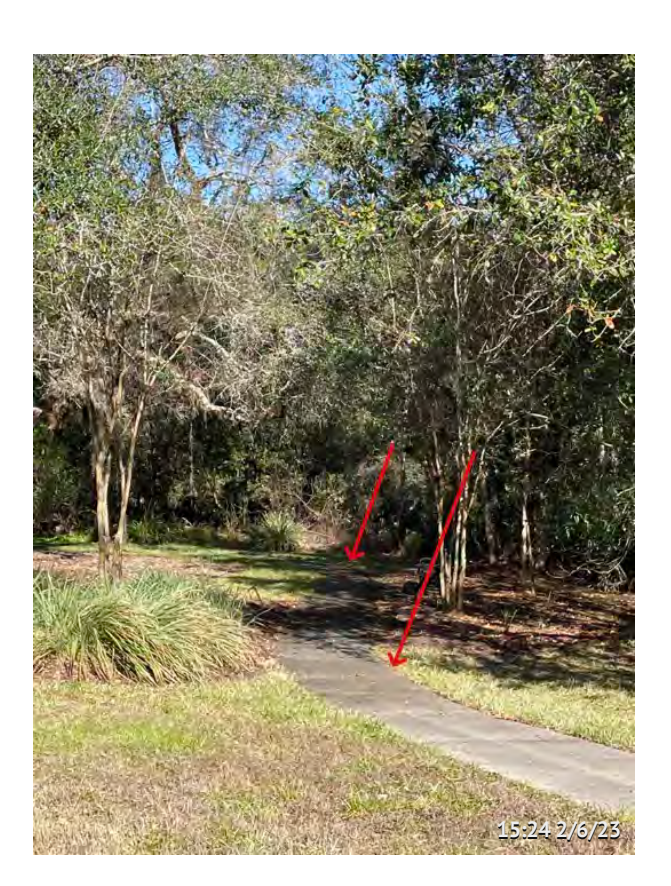
Item 29 - Harmony Estates Pocket Park