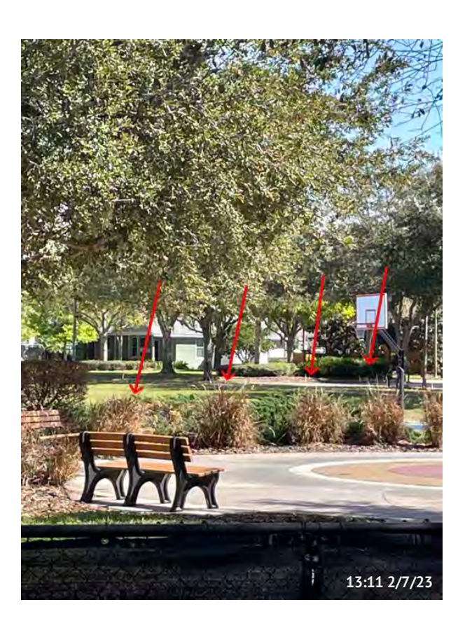
Item 47 - Buck Lake Pavillion Assigned To Benchmark Plants needs attention.