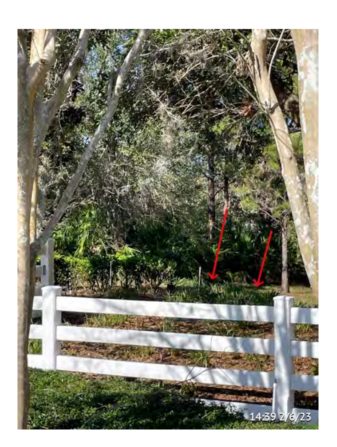
Item 13 - Behind Harmony Sign (West Entrance)