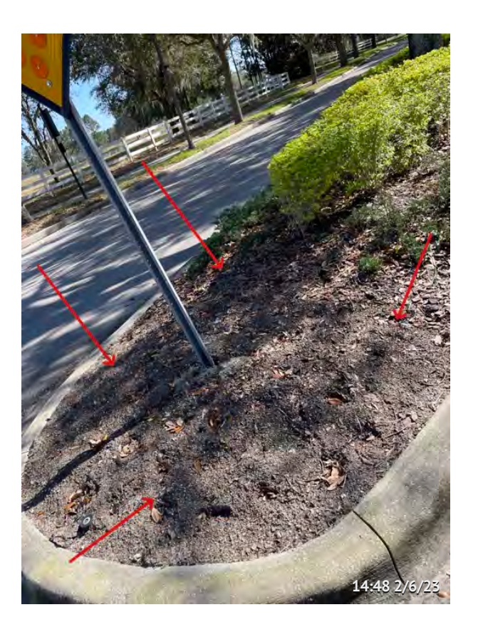
Item 17 - East Entrance Median Assigned To Benchmark Seasonal Plants Proposal.