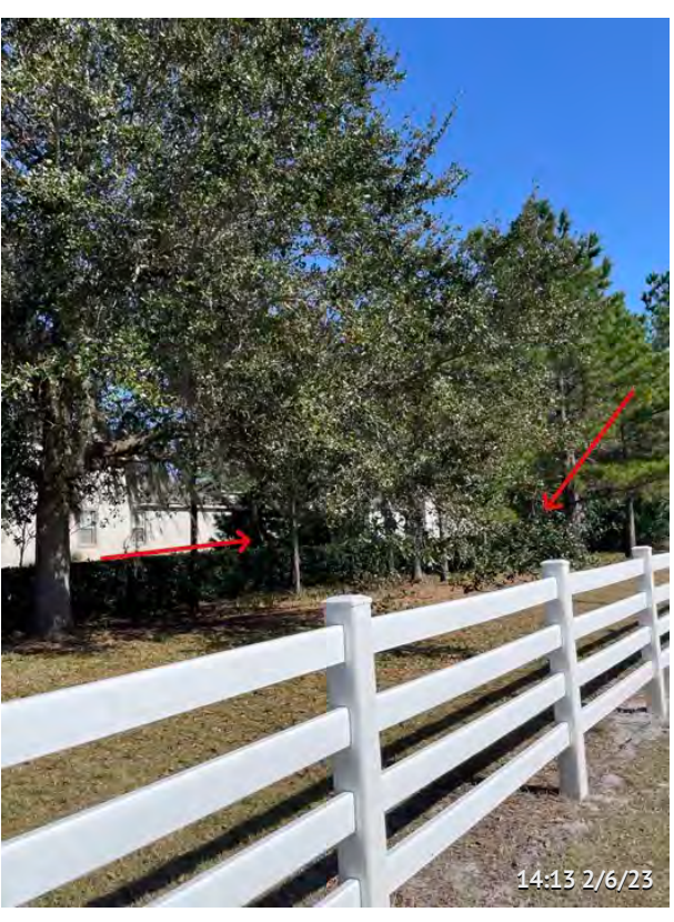
Item 4 - Behind Fence US-192 (West Side)

The tree branches need to be trimmed up.