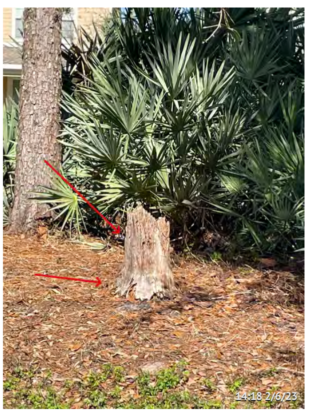
Item 6 - Behind Fence US-192 (West Side)

A Tree Branch is almost touching the electric cable, needs to be trimmed up.