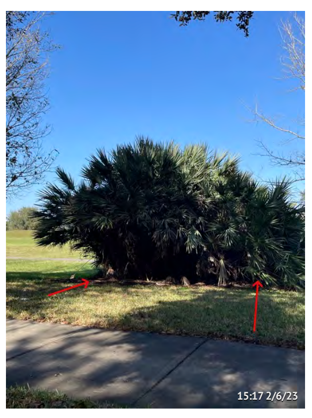
Item 28 - Five Oaks Dr. Assigned To Benchmark Palmetto's throughout Five Oaks needs attention.