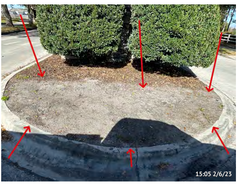
Item 24 - East Entrance Media Assigned To Benchmark Seasonal Plants Proposal.

Tower needs to be Pressure Washed, Needs vendor proposal.