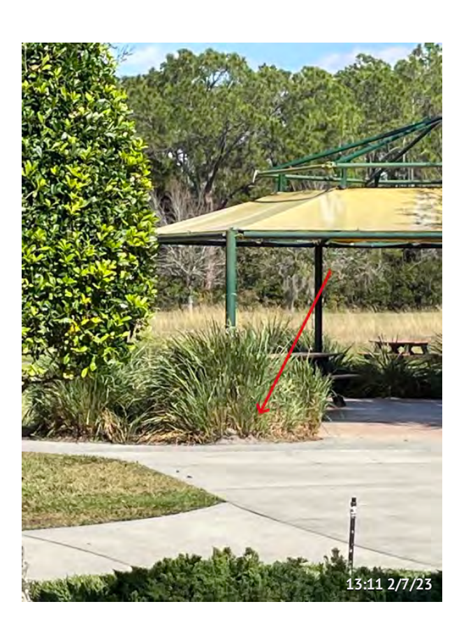
Item 45 - Buck Lake Pavillion Assigned To Benchmark