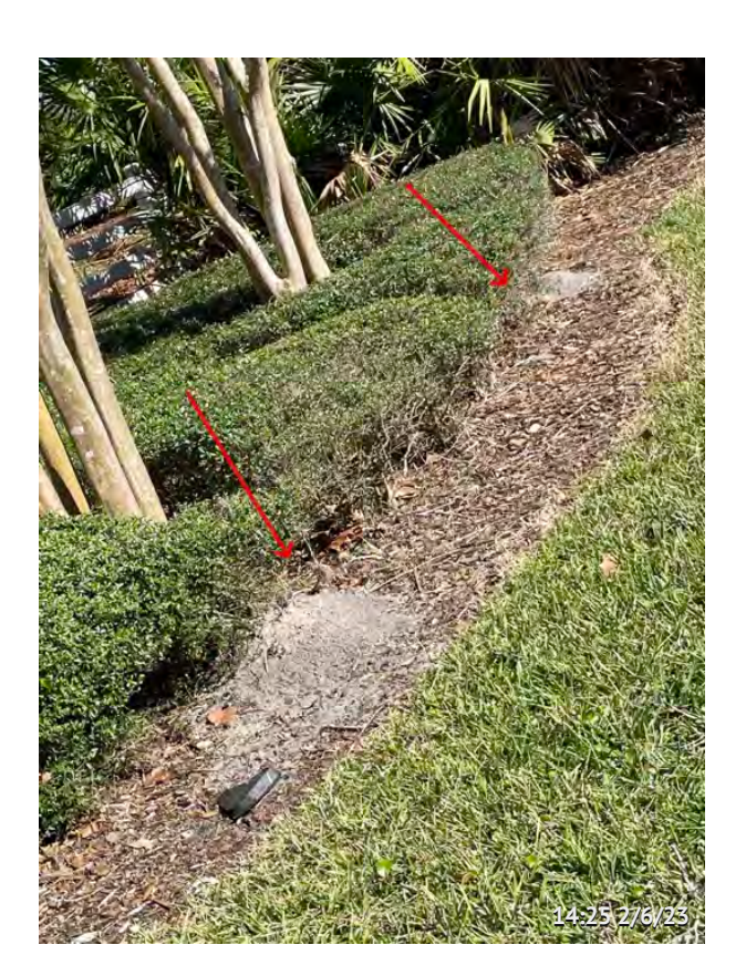
Item 9 - Front Fence US-192 (West Side)