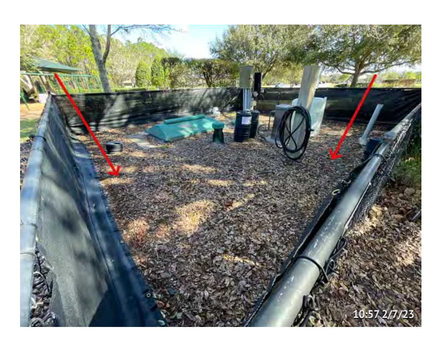
Item 43 - Splashpad Equipment Assigned To Inframark