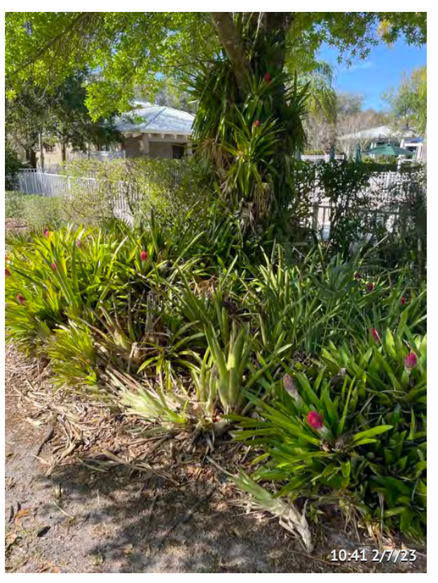
Item 38 - Swim Club Assigned To Benchmark The garden needs attention.