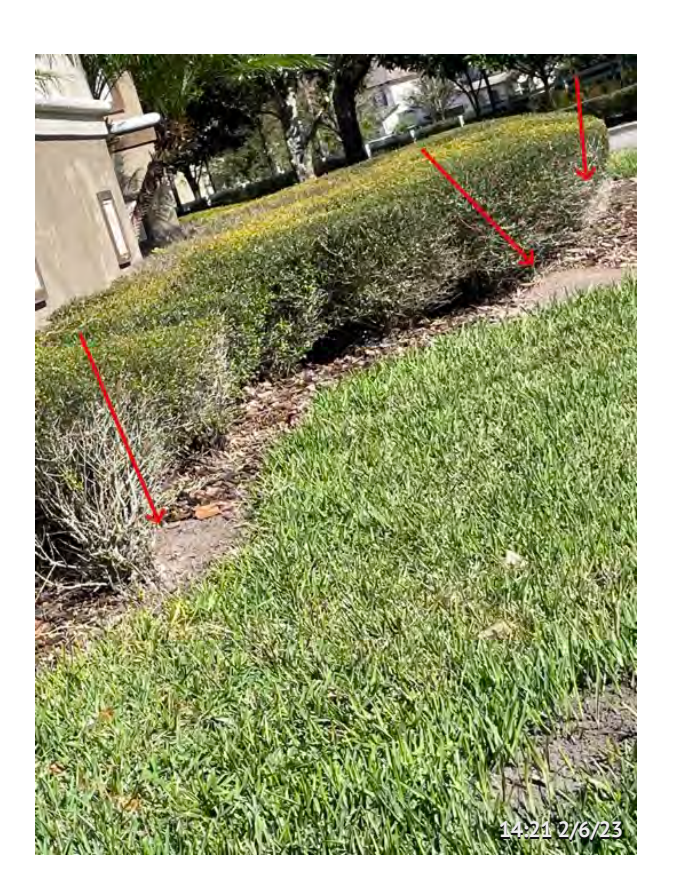
Item 7 - Harmony Sign (West Entrance)