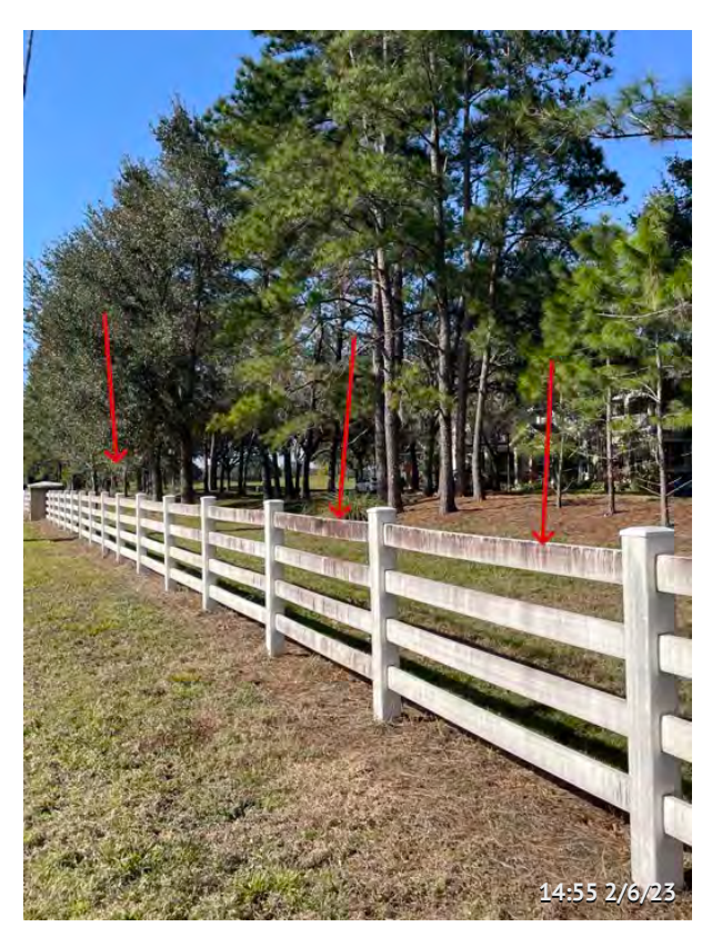
Item 20 - Clay Brick Rd. US-192 Fence