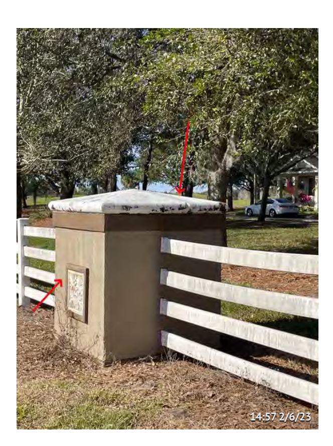
Item 21 - Clay Brick Rd. Fence Tower