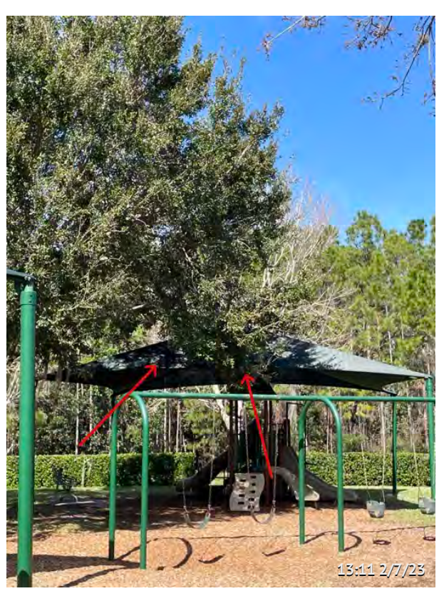
Item 44 - Buck Lake Pavillion Assigned To Benchmark A tree trimming proposal needed.