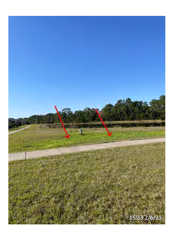
Item 33 - Five Oaks Dr - Front School