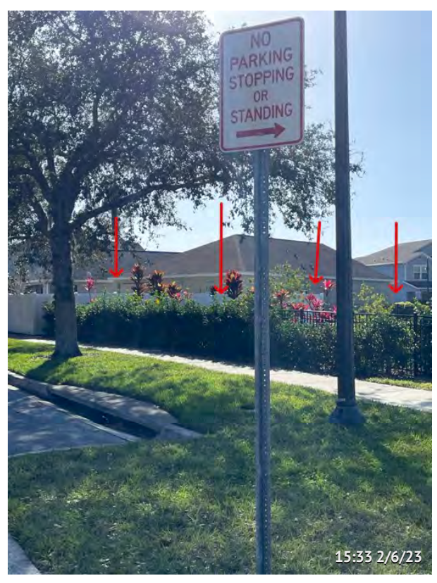
Item 32 - Five Oaks Dr - Front School Assigned To Benchmark Bushes needs to be trimmed up. (Hedges)