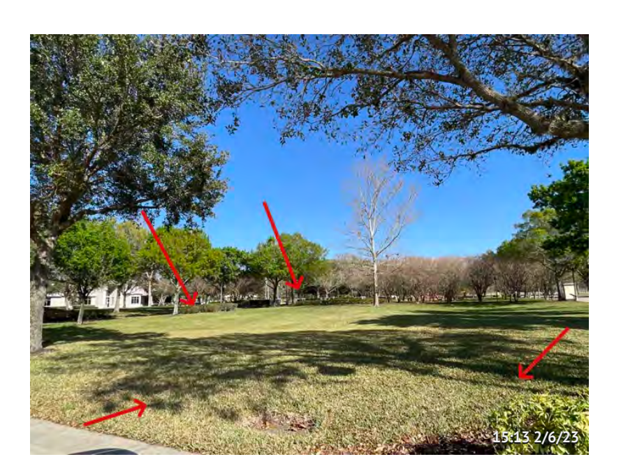
Item 27 - Townsquare Assigned To Benchmark Grass burned in some areas.