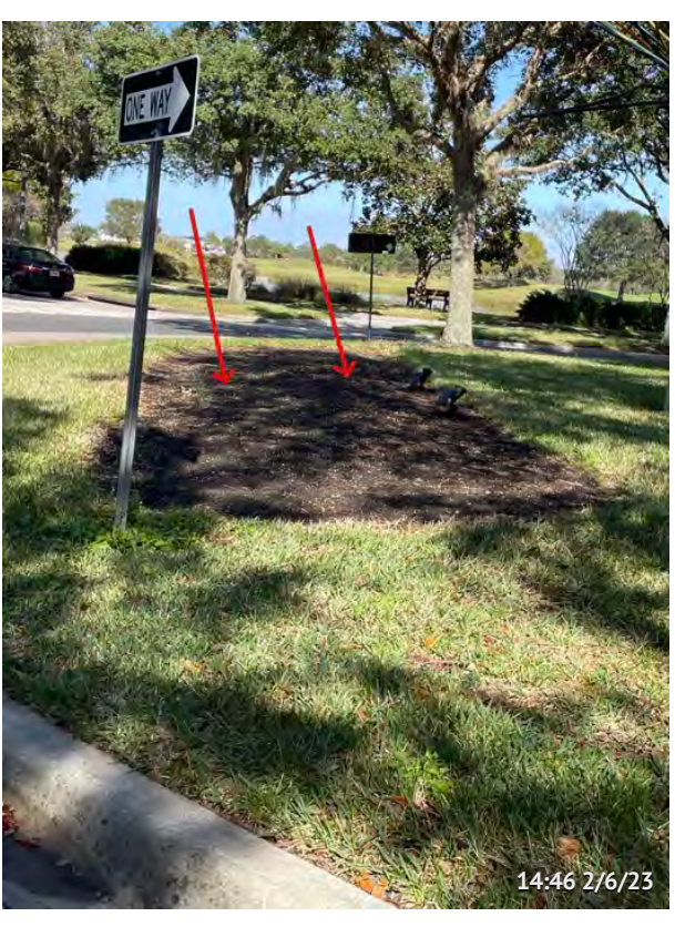
Item 16 - Five Oaks Dr -Schoolhouse Rd Roundabout

Assigned To Benchmark Seasonal Plants Proposal.