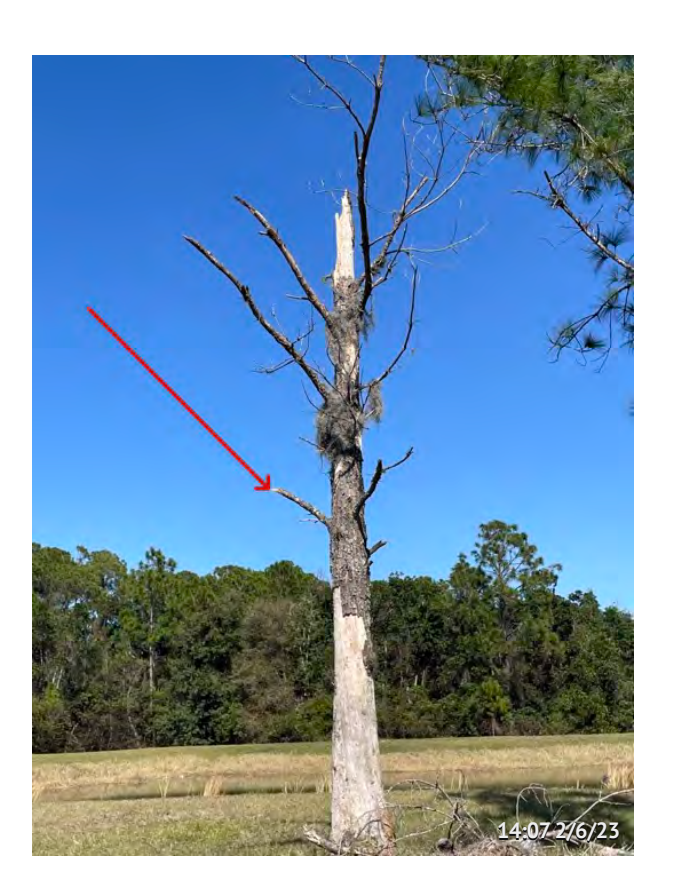
Item 1 - Behind Fence US-192 (West Side)