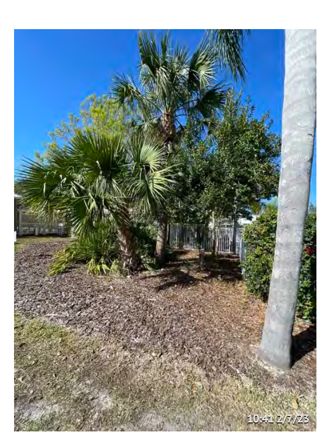
Item 37 - Swim Club Assigned To Benchmark Grass growing between the mulch.