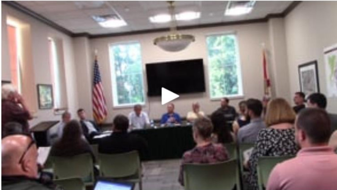
September 18, 2019

admin@celebrationcdd.org (c/o Kristen Suit)