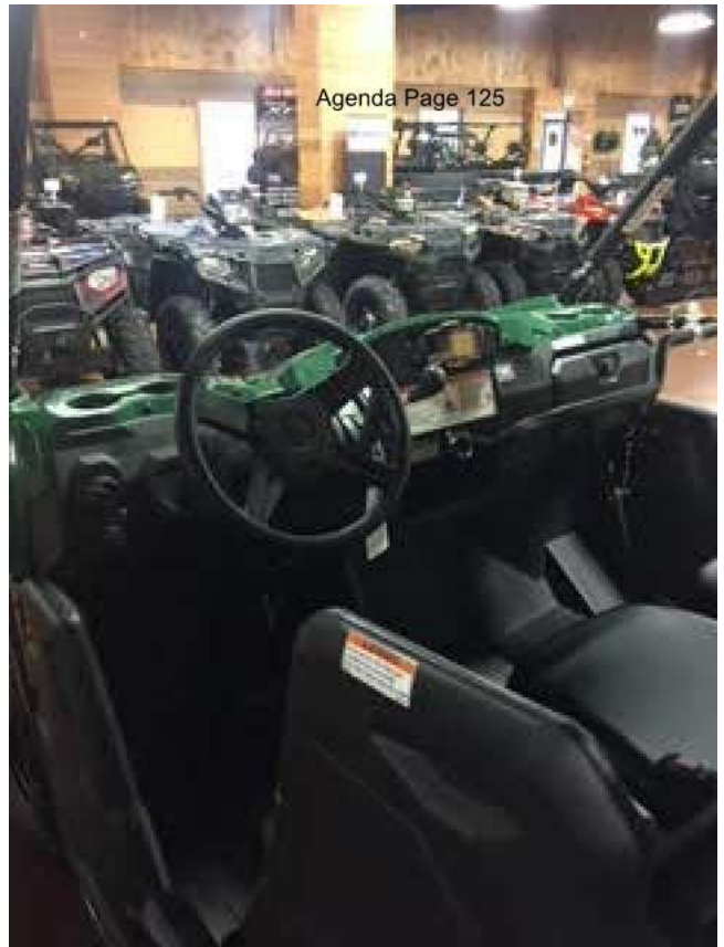
Agenda Page 125