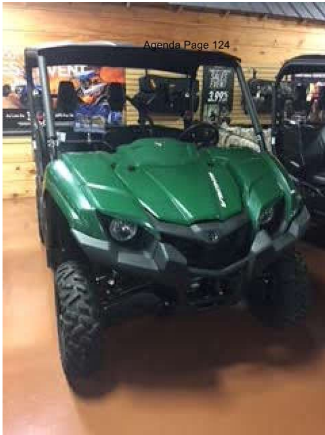
Agenda Page 124