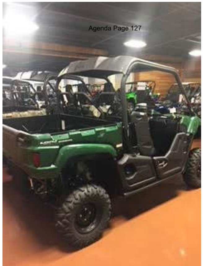
Agenda Page 127