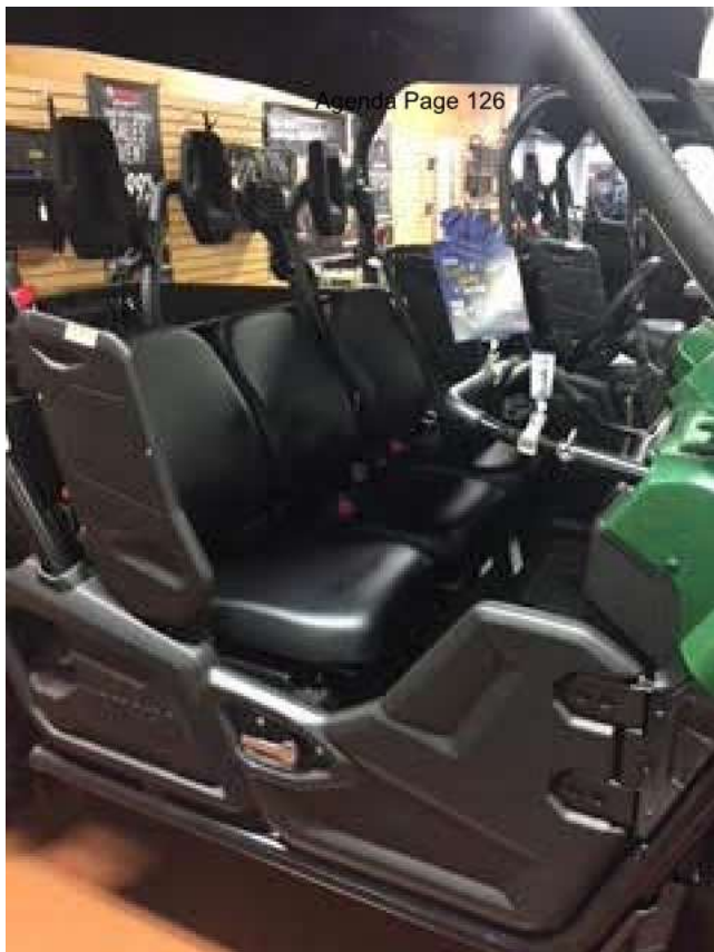
Agenda Page 126