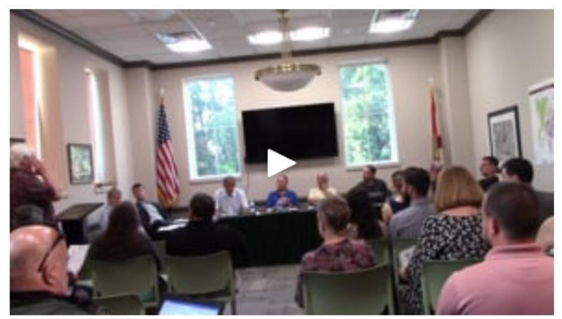
September 18, 2019

admin@celebrationcdd.org (c/o Kristen Suit)